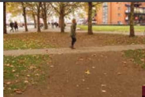
Far left: existing south Gardens Left: existing north Gardens