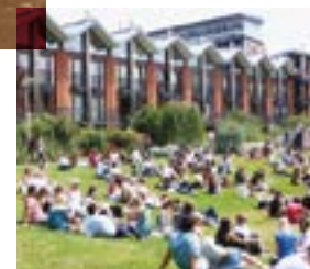
Bernie Spain Gardens south