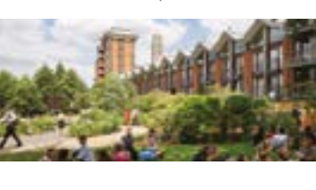
Right: riverside walkway Below: Bernie Spain Gardens south