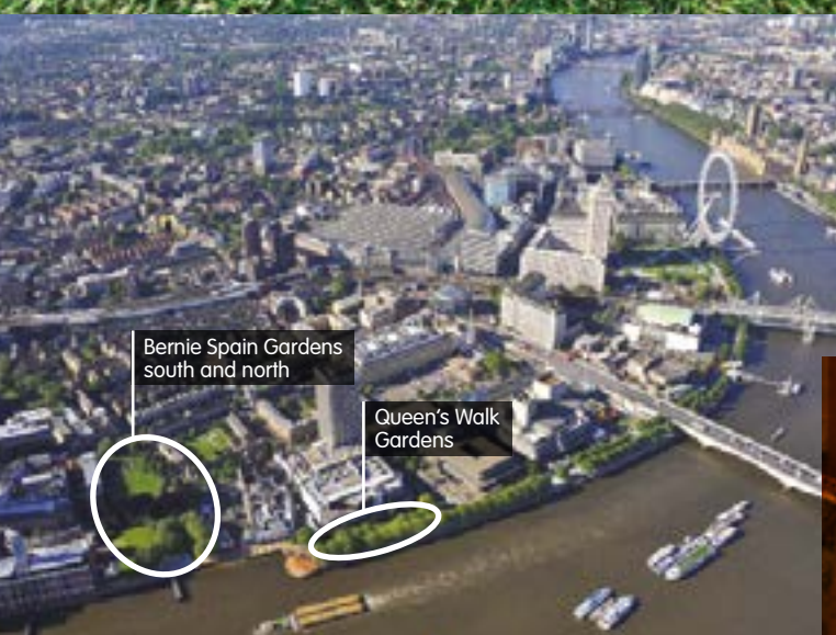
Bernie Spain Gardens north and south, proposed Queen's Walk Gardens