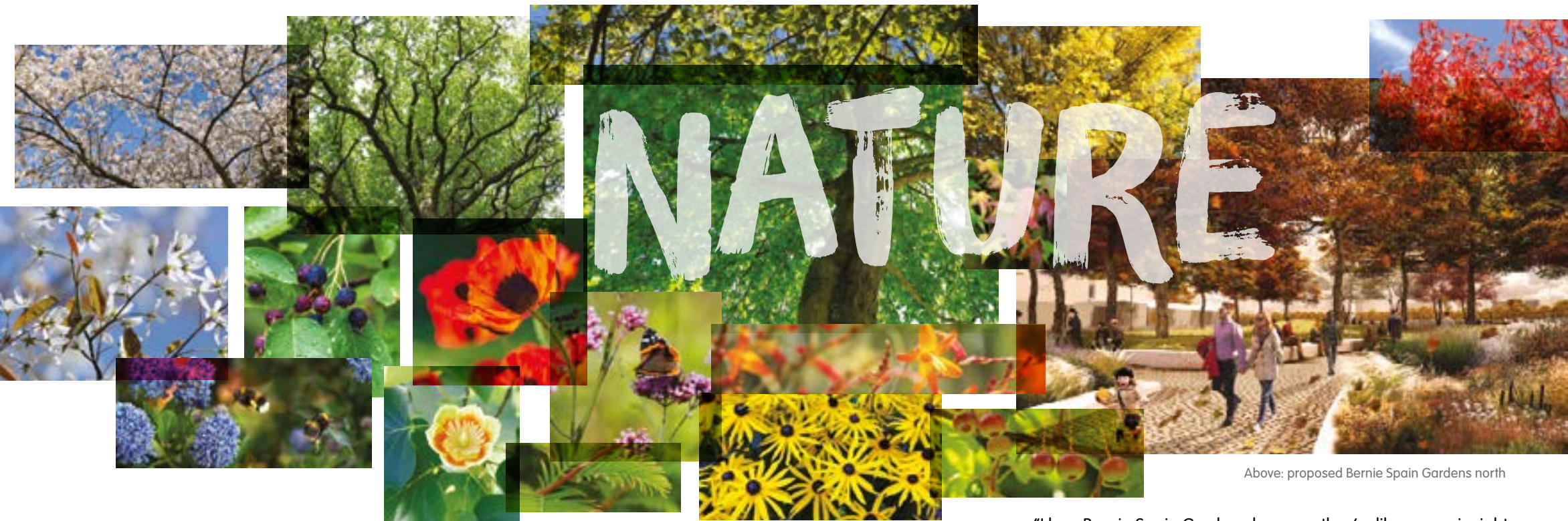
Above: proposed Bernie Spain Gardens north

All trees and plants shown in this publication feature in the designs for Bernie Spain Gardens north