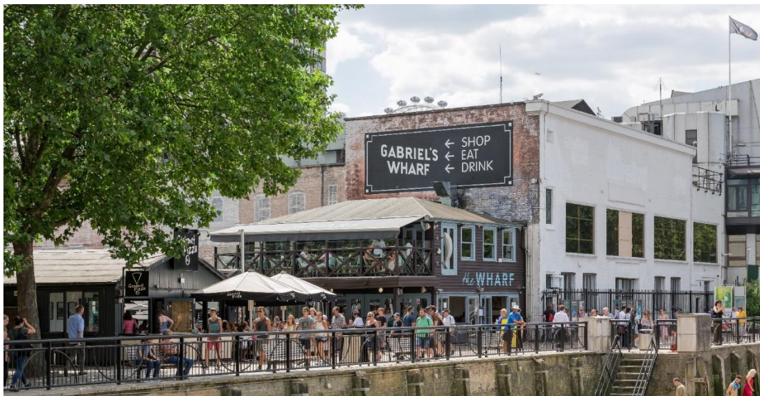
Doon Street development

To safeguard its independence, Coin Street has always sought to avoid reliance on public sector contracts and revenue grant income. Our only public sector contracts are in respect of the Coin Street family and children's centre - and these SLA payments represent less than 2% of our turnover.