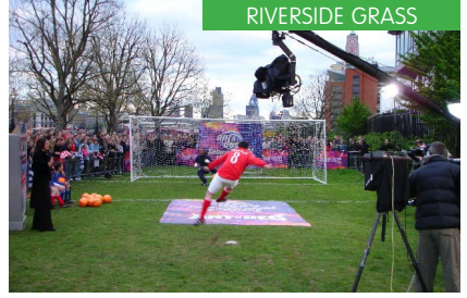
Credits include: Toff Guys, Unlocked, Our Kind of Traitor, Love Actually, Apprentice, Surprise Surprise, Secret Diary of a Call Girl, Origins of Us. ITV's This Morning, Loose Women, Good Morning Britain and Lorraine all regularly broadcast live from the sites.